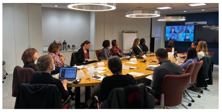
Civil society organizations meet virtually and in-person.

More than 24 colleagues from 11 NGOs participated virtually and in-person to discuss the role of CSOs in the dispute resolution process, dispute resolution outcomes, and other topics.